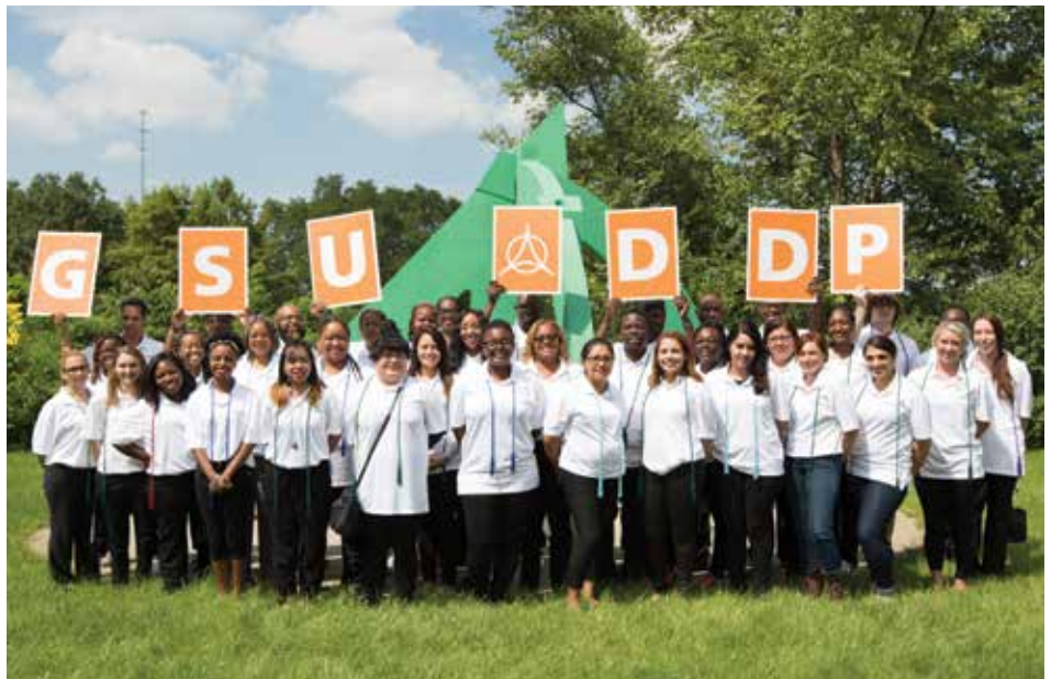
DDP students at the DDP Grill & Chill, a pre-Convocation cording event celebrating the beginning of a new school year and welcoming new GSU-DDP transfer students to GSU. DDP students were presented with a DDP honor cord recognizing the completion of their associate degree from their community college and led the processional of students into the GSU Convocation.

increased 83%, and DDP student enrollment at our partner community colleges at the City Colleges of Chicago increased by 418%, all of which were achievements in our Reaching Vision 2020 Strategic Plan goals and objectives. And DDP growth does not stop there! We are proud to announce that DDP's largest