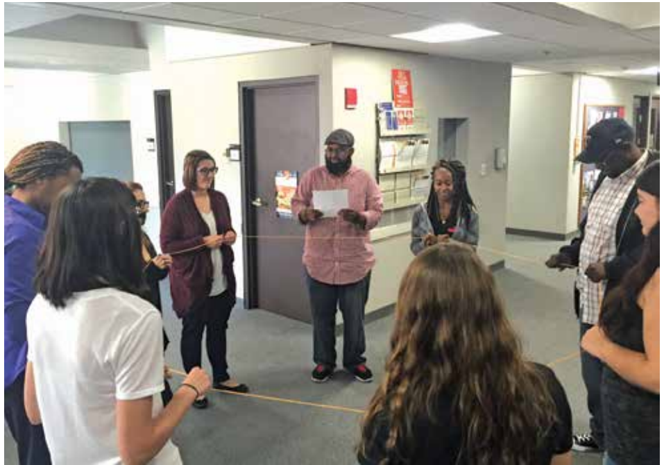
DDP Student Transition Assistants at the STA Orientation Retreat, an opportunity for STAs to learn about various resources and concepts surrounding the topics of communication, diversity and inclusion, team building, leadership, and more.

DDP also entered the Fall 2016 semester with great growth in numbers. Along with having participants at all seventeen community college partner campuses, in the 2015 – 16 academic year overall DDP student enrollment increased 23%, DDP student enrollment at our remote community college partner campuses