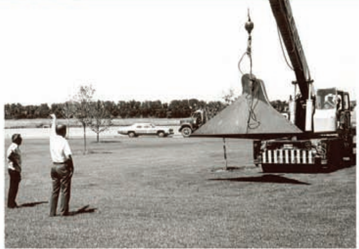
Richard Hunt's Outgrown Pyramid II (1973-74) arrives on campus, ca. 1976