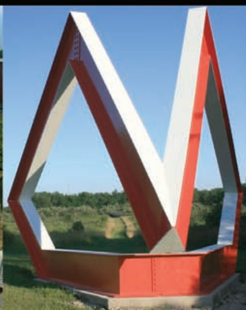
September view of Phoenix .

Edvins Strautmanis's steel I-beam sculpture from 1968, Phoenix , was straightened on its pad, sandblasted, primed, and given a new coat of paint during the summer. The signature artwork was the first sculpture to be permanently installed on the GSU campus and was a gift of Lewis Manilow.