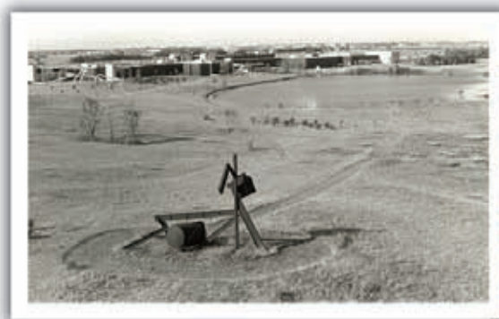
Photo above: Mark diSuvero's Yes! For Lady Day (1968-69) stands lonely lookout in this pre-1976 aerial view of the GSU campus.