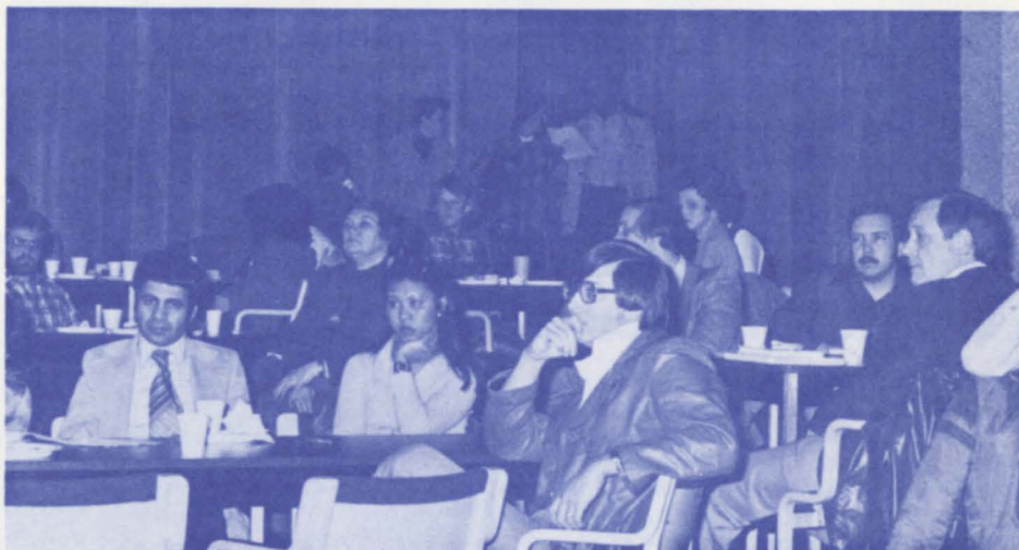
Participants in SHP workshop.