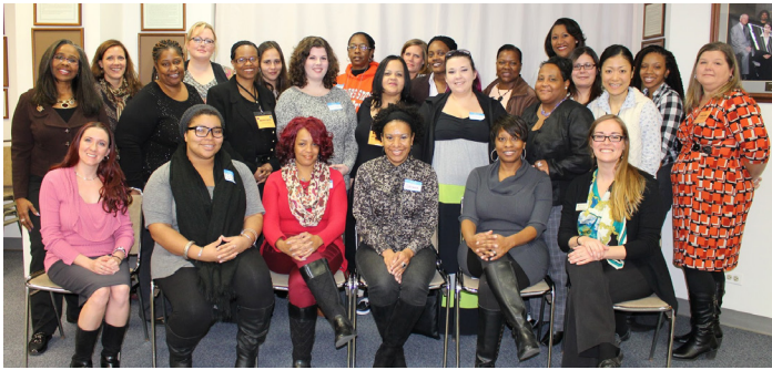
The SHERO Women's Leadership Symposium [S – Sharing, H –Herstory (of), E – Empowerment, R – Resilience (&), O – Opportunity]. The conference is inclusive to all genders looking to support leadership.

On Friday, November 7 eighteen students participated in the first SHERO Women's Leadership Symposium. The goal of the symposium is to inspire women to seek their highest level of personal and professional development. The program provided perspectives and strategies in the areas of personal development, career development and advancement, and community engagement. The conference format included a featured presentation and breakout discussions to celebrate SHERoes and diversity. A student participant stated "I thought the symposium overall was a great training experience. I left there feeling empowered, inspired, motivated, and educated."