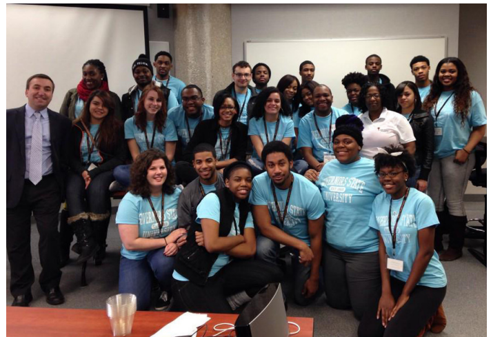
Orientation Leaders getting ready for the January Transfer/Graduate Orientation!