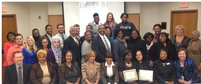
The Certified Executive Officer (CEO) Leadership Certificate Program is designed to provide student leaders of clubs and organizations effective and essential leadership skills.