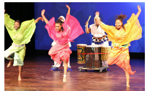
Ayodele Drum & Dance Company