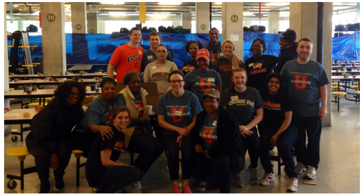
ASB in Chicago at the Pacific Garden Mission, founded in 1877, is a homeless shelter and rescue mission located in the South Loop.

The Civic Engagement and Community Service Center (CECSC) partnered with Break a Difference to organize the first out-of-state Alternative Spring Break, which took place from March 15-21, 2015 in San Francisco, California. Break A Difference is a nonprofit organization with the mission of propelling young leaders on a trajectory of lifelong service by providing immersive community impact opportunities across the globe through alternative break programs. Six students and two faculty members from GSU travelled to the west coast to assist in youth development and instructive activities to support enriching education for youth in the Bay Area.