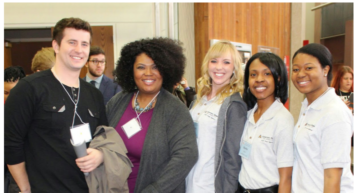
Participants of the inaugural Inclusive Leadership Conference co-sponsored by Intercultural Student Affairs and Dual Degree Program.

Held on Friday, January 23, to coincide with campus wide Dr. Martin Luther King, Jr. Day celebrations, the Inclusive Leadership Conference was co-sponsored with the Dual Degree Program. With a theme of "Lift Every Voice," 165 participants from GSU and five partner community colleges explored the understanding and appreciation for diverse identities amongst students through social justice education. Among other goals, the Inclusive Leadership Conference helped students understand the intersection of leadership, diversity and social justice. Among the most powerful reflections of the day, a student said, "I learned more about myself today than I have in the last 35 years."