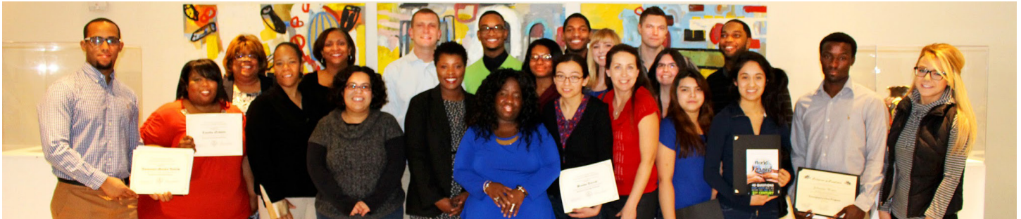
The Student Leadership Institute, Graduate Leadership Scholars and the Emerging Leaders Program Closing Ceremony was held on March 10, 2015.