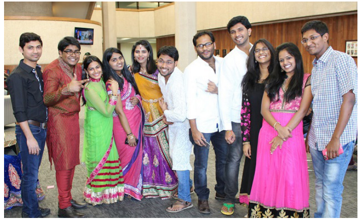
Members of the International Culture Organization and the International Dance Club participated in the International Fashion Show held on March 11, 2015