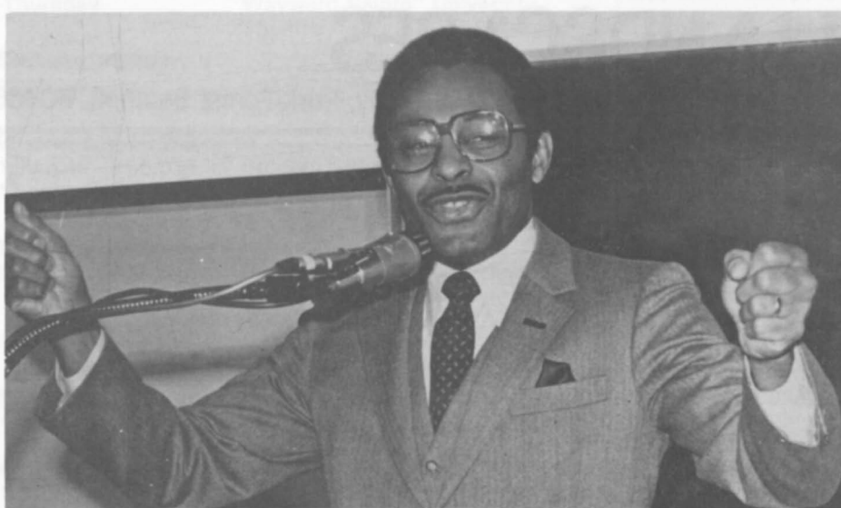
Illinois State Comptroller Ronald Burris analyzed state budgetary problems for the upcoming year before a group of students and community members recently at GSU. He was the final speaker on a lecture series entitled "U.S. and Illinois Elections," which featured nine prominent lawmakers, other public officials and political analysts.