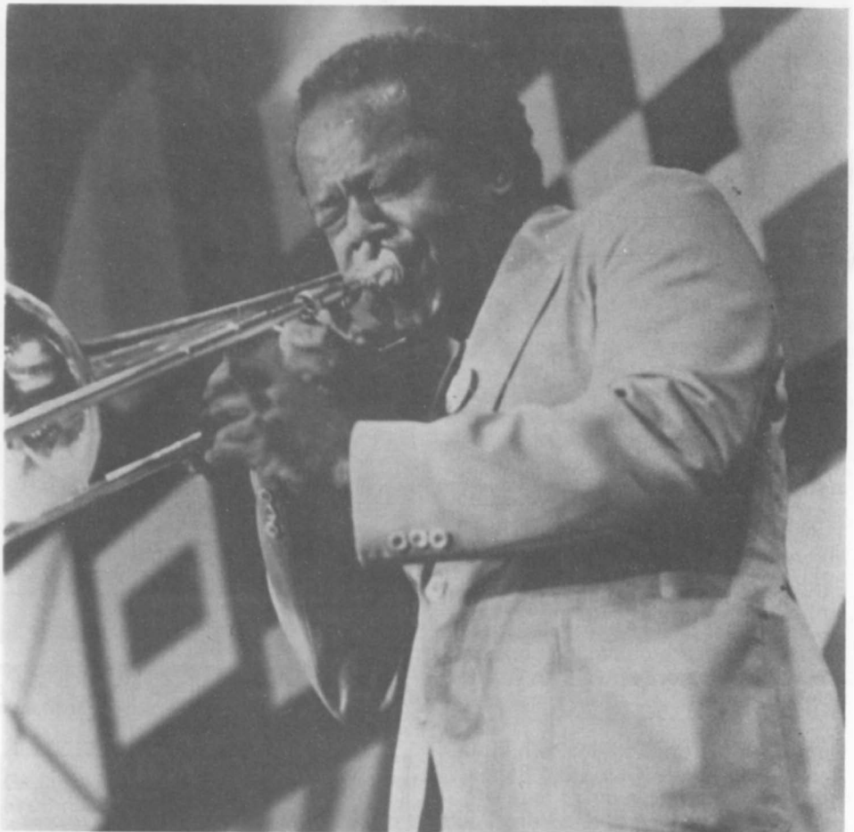
Slide Hampton, internationally known jazzman, conducts clinics at GSU.

The conference was sponsored and hosted by GSU's offices of Admission and Student Recruitment and Community College Relations.