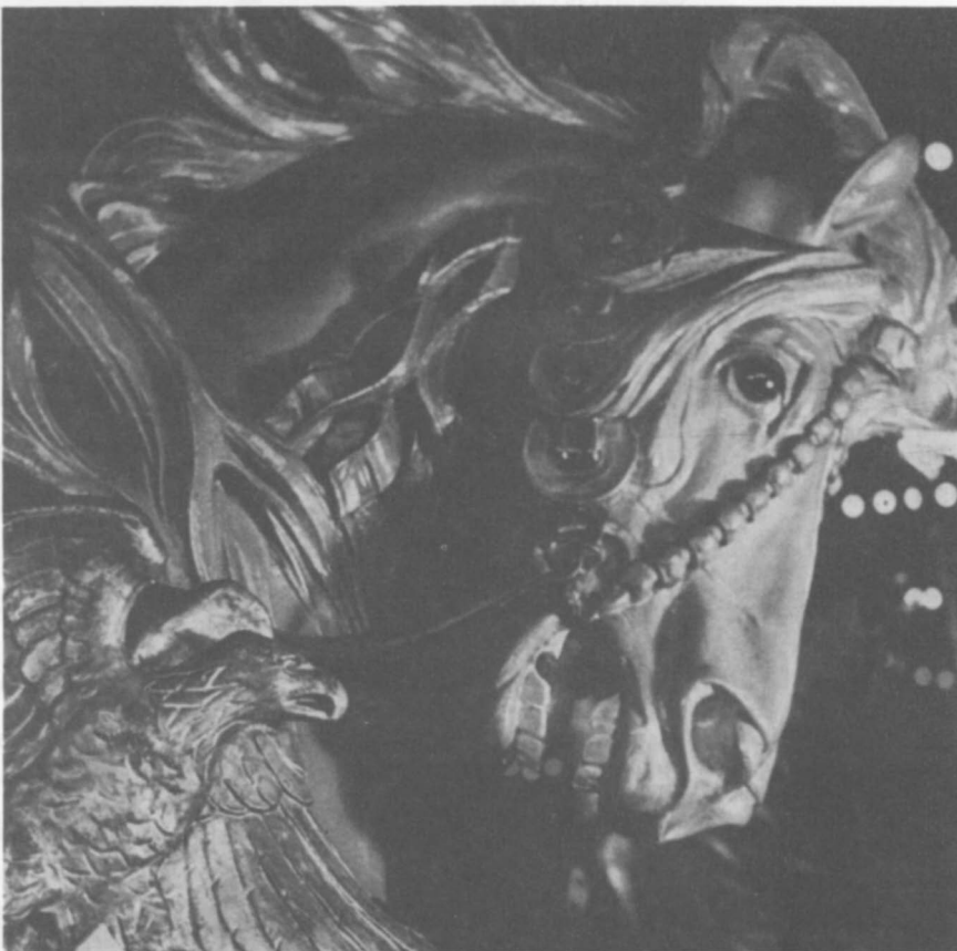
Carousel horse, example of late 1800's American folk art.