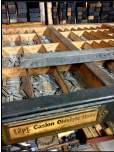
Caslon old style italic by SerenityRose . Licensed under CC BY-NC 2.0 International