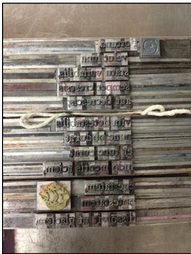
Setting O Fortuna by SerenityRose . Licensed under CC BY-NC 2.0 International