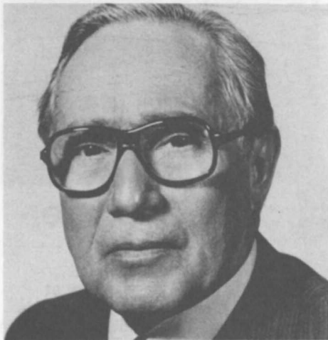
Philip M. Klutznick