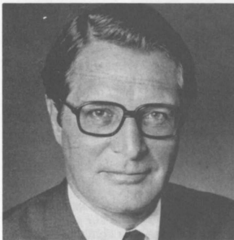
Elliot L. Richardson

Two internationally prominent lawyers-businessmen, whose aggregate public service to their respective states and the nation total some 70 years, will be honored with the degrees of Doctor of Humane Letters by GSU at the Thirteenth Annual Commencement exercises.