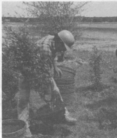
Landscapers set in trees and shrubs at the Stuenkel Road entrance to GSU. The sculpture is "Icarus" by Charles Ginnever.