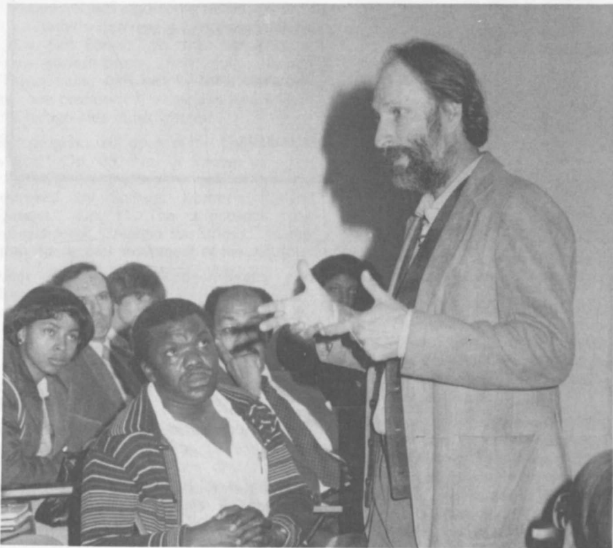
Bruce Nauman, sculptor, creator of "Divided House," responds to queries about his new work in Nathan Manilow Sculpture Park at an informal session held recently in CAS' Media Dome.