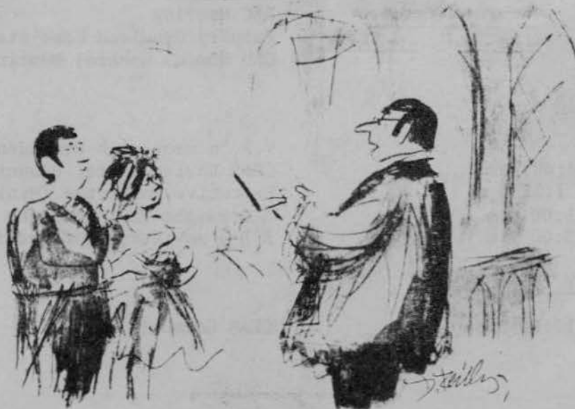
... to have and to hold in counterproductive as well as productive time frames, so long as you are bilaterally capable of maintaining a viable life-style. . . ."