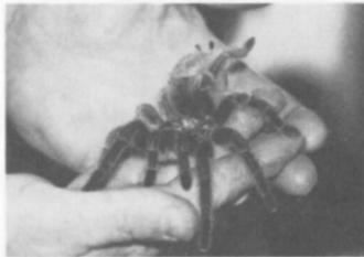
The tarantula was harmless.