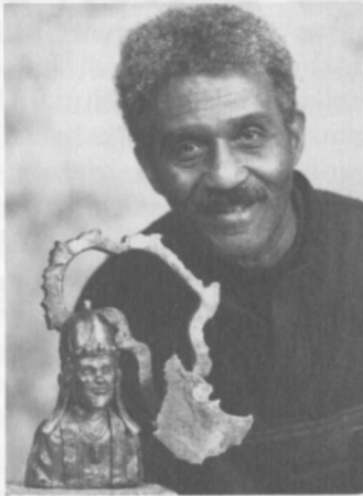
Grant White uses a theme of African-American achievements in his bronze sculptures, including this one recognizing one of three Catholic Church popes from Ethiopia.

White has titled it "Call for the American Black Man." Black women and children are linked in anguish across a United States map that is striped in red, white and blue. From it, drops of rich red blood are dripping. Black men are represented outside the map area. "It's my way of saying our men need to come back and support their women," White explains.