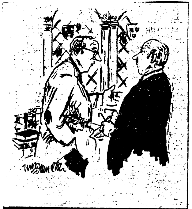
"They're changing English 45 to Communication Techniques-232, Chaucer to Erica Jong, and me to tape."