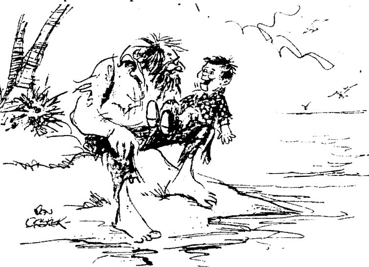
"If it wasn't for you, I think I would have gone mad."