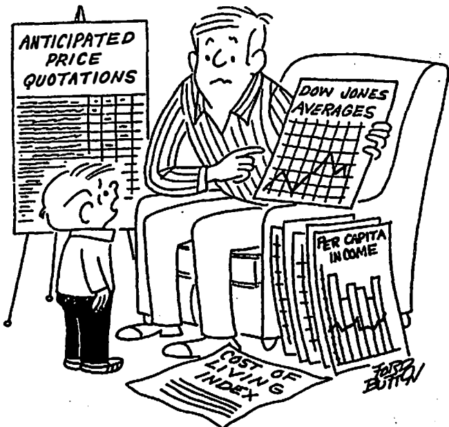
"But all I did was ask for a dime!"