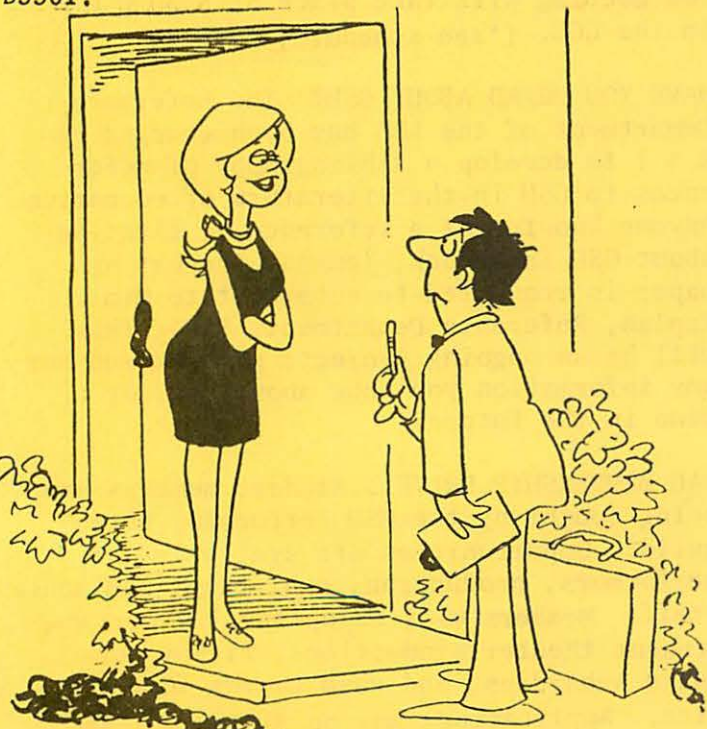
"Yes, my husband does make a lot of money ... in fact, I pay ALL of my employees well."