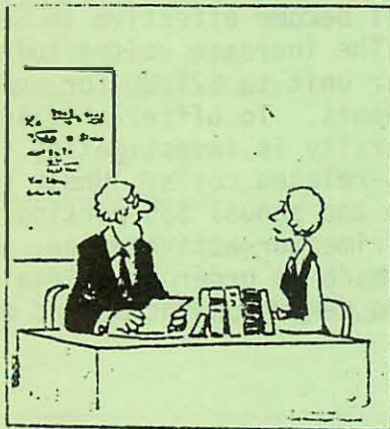
"This university is big, but it is NOT impersonal, Miss whatever your number is!"