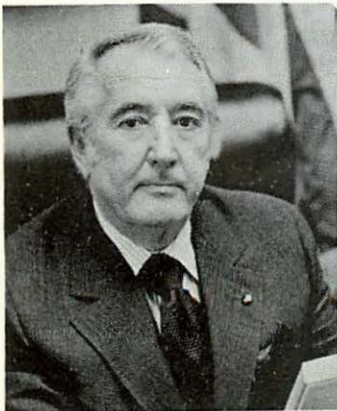
The Honorable Peter W. Rodino, Jr. To Receive Honorary Degree

Reception on the Governors Patio, adjoining the Hall of Governors.