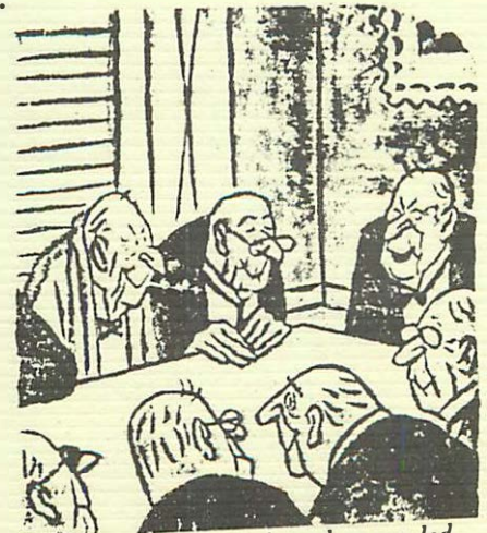
"Then it's moved and seconded that the compulsory retirement age be advanced to ninety-five."