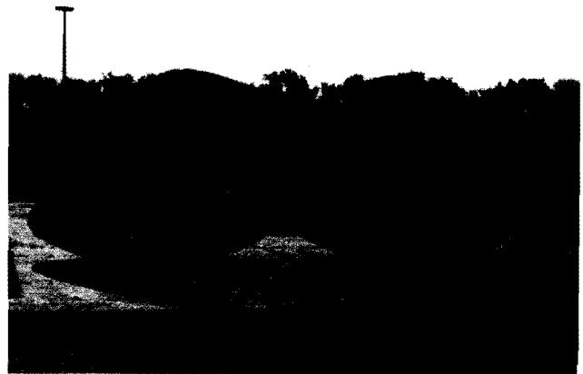
"Armature" awaiting Highstein's welding and coating process.