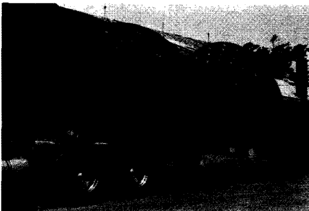
Steel armature of "Flying Saucer" arrives at GSU, Monday, July 21.

Note: all concrete for the piece is being donated by the Arquilla family of Burnside Construction Company in Glenwood and Accurate Redi-Mix Concrete Co. of Hazelcrest.