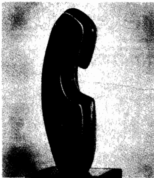
Walnut, aluminum laminate done by Peg Wagner.

"CONTINUANCE" . . . an exhibition of sculpture by graduate student Peg Wagner, is this month's show in the CAS Art Gallery. A variety of pieces can be seen, most of which have been done in types of hardwoods. "Walnut Silken Trio" plus an oak and walnut laminate exemplify Wagner's artistic statements. The CAS Gallery is located in B Wing adjacent to B Lounge and is open 10:30 a.m.-5:00 p.m., Monday-Thursday.