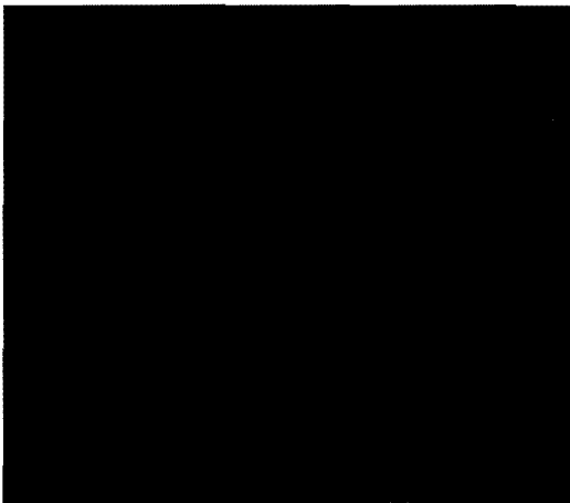
Bella Abzug, Former Congresswoman

GSU POLITICS IN '80s COURSE TO FEATURE BELLA ABZUG LECTURE . . . Bella Abzug, one of the most colorful and popular women on the recent American political scene, will present a public lecture at GSU on "Politics of the '80s" at 8:00 p.m. on March 12. Abzug, a member of the U.S. House of Representatives from New York--1970 to 1976, has been active in local and national politics and a leader in such causes as civil rights, women's rights and world peace for more than three decades. Admission to the lecture is $2.00 for the general public, $1.00 for GSU faculty and staff, GSU Alumni Association members and senior citizens. GSU students are admitted free. The lecture is presented as part of a course by the same title being offered by GSU.