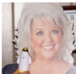
Pierre and Paula