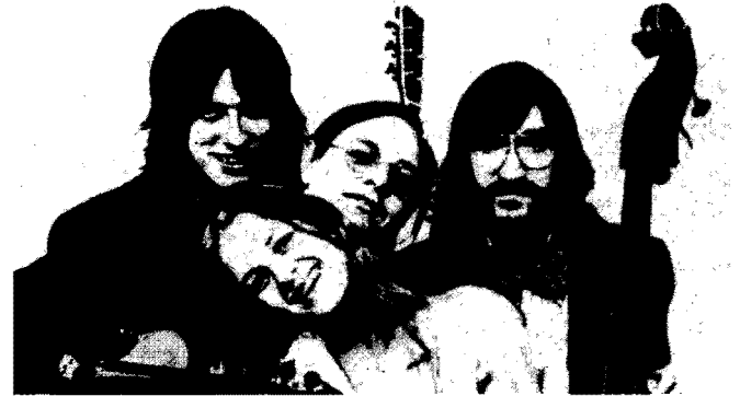
The Buffalo Chipkickers

Special Consensus. Basically bluegrass, they also include new material and lace the performance with country rock and swing from their earlier days. THE BUFFALO CHIPKICKERS also have played in the southern suburbs and on numerous