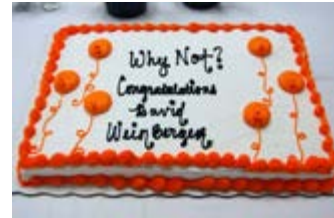
Why Not? Celebration Cake