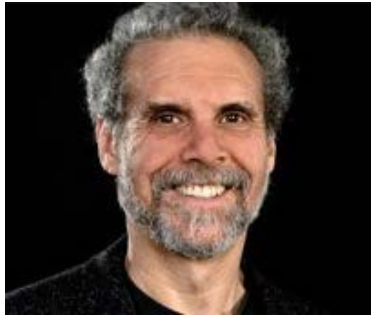
Dr. Daniel Goleman, author of "Emotional Intelligence"

Join us for a free lecture and presentation followed by a Q & A with Dr. Daniel Goleman Monday, March 23, 2015, at 5:30 p.m. in the Center for Performing Arts. Dr. Goleman will also participate in a free pre-lecture discussion with students, faculty and administrators at 3:30 p.m. on the CPA stage.