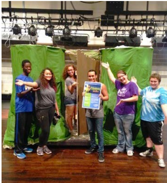
Performers in the Crete-Monee Enrichment Program rehearse a scene from "Shrek the Musical."

"Shrek the Musical" is based on the Oscar-winning DreamWorks Animation film, and is a TONY Award-winning fairytale adventure. It features all new songs and brings all the beloved characters from the film to life on stage. It's irreverent fun for the whole family.