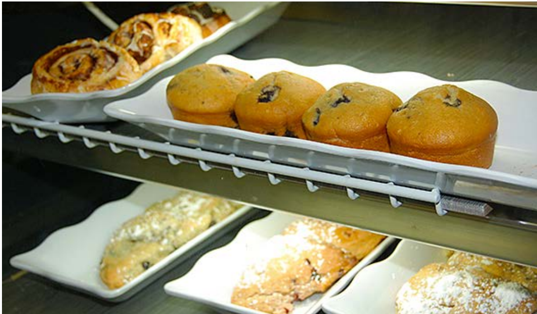
Muffins, sweet rolls, and scones are baked each morning.

"We have new concepts and new menus," Stacy said. "We are approaching this from a different, fresh angle." For Stacy and the café staff of 13, that means entrée stations that change every day, featuring healthier concepts in food preparation.