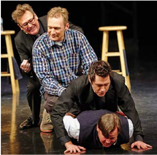
Whose Live Anyway?