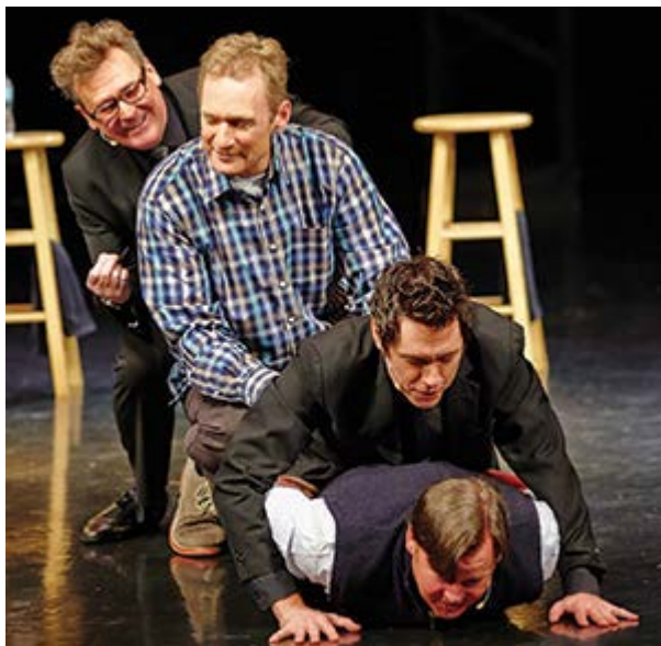
Whose Live Anyway?