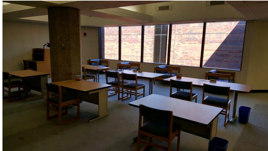
Individual Quiet Study Area

To the left of the balcony is our newest Individual Quiet Study Area with study tables, carrels, and comfortable chairs. There are also other designated study areas throughout the library. Ask at the library information desk.