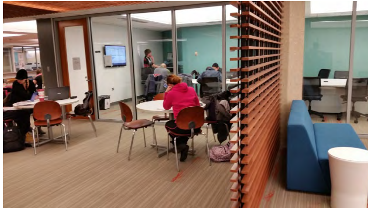
Group Study Rooms

Don't forget the library Group Study Rooms . Reserve them at the Tech Desk.