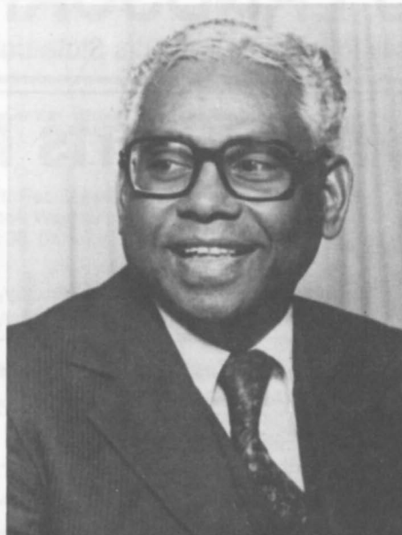
K. R. Narayanan, ambassador to the United States from India, was a keynote speaker at the Eighth Annual Third World Conference sponsored by GSU at McCormick Inn, Chicago, March 24-27. His topic was "Global Interdependence and National Development: The View from India," at the 6 p.m. plenary session on Thursday, March 25.

GSU offered undergraduate or graduate academic credit of one to three hours to qualified students who attended the conference.